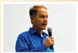
Renewed Prayer for America's Colleges