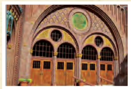
Historic Church Experiences Historic Movement