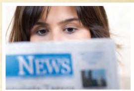
Revival Breaks Out in Mississippi